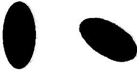
Image 1. A simulated ellipse. Image 2. An imaged ellipse.

be applied to sub-pixel edge-point data; and (3) It is computationally cheaper. The fundamental reason due to which this method leads to a more accurate estimation lies in the interpretation of a pixel as a point rather than as a unit area: That is, in the case of area-moment estimation based on run-length code, a pixel is assumed to be a unit of area; while, in the case of application of Gauss' theorem to area-moment estimation, a pixel represents a point without area. This difference is clearly seen in the results of area estimation of the simulated ellipse: The run-length-code based method yields 5757 squared pixel units, while the application of Gauss' theorem results in 5622 squared pixel unit, while the actual area is 5654.867 squared pixel units. Clearly the application of Gauss' theorem leads to a better estimation. The above contradiction between a pixel as a point and a pixel as a unit area is a classical problem in computer vision [18].